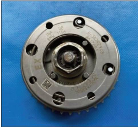
The circlip is in place in this image

The subject car was a BMW 218 with engine code B38B15A. On initial scan of the BMW, a fault code 130308 (Exhaust Cam position not reached) was present. This code was indicating a valve timing position error, and the engine was noisy from the timing chain area.