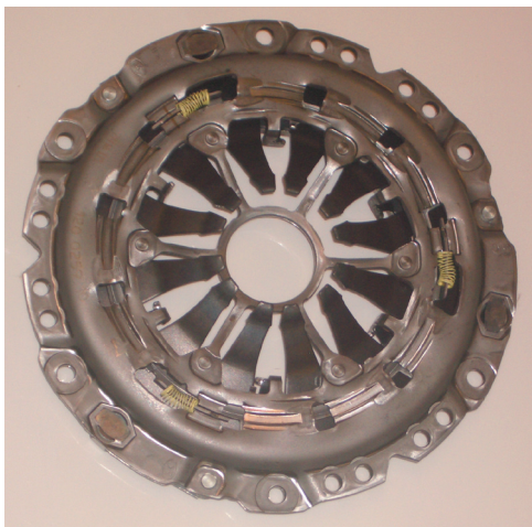
Clutch Cover with Self Adjust System

HK2097 now contains a 'traditional' type clutch cover assembly as shown below.