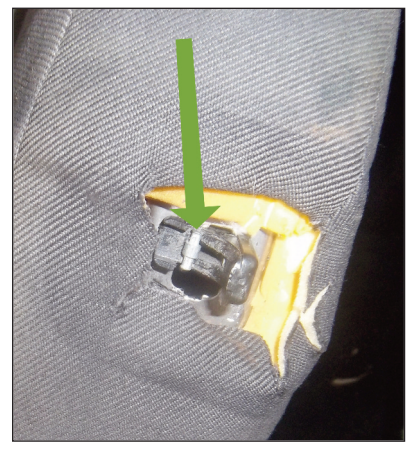
The cable had become detached from the handle

When loading a child into the baby seat fitted in the rear of a two door Ford Fiesta, one of the requirements is that the tilting of the front seat back operates correctly. The owner understandably preferred to load the little one into the baby seat from the passenger's side of the vehicle.