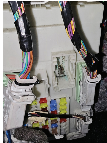
Corrosion was caused by washer fluid wicking up the loom into the Body Control Module

Significant corrosion on this body control module connection plug, and severe damage the body module pins was quickly spotted. The extent of the damage meant that a new body module needed to be installed, and the connection plug was re-pinned. And a new washer pump was fitted.