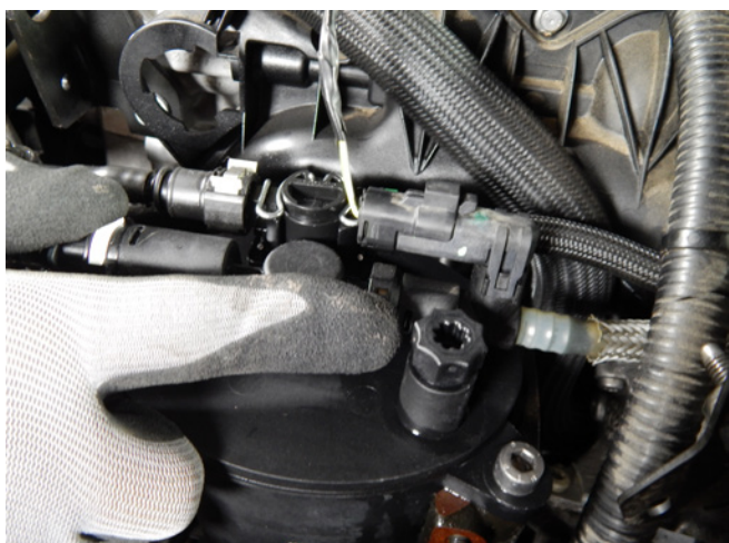
Figure 3 Bleed screw

This filter design enables the draining of the water from the top of the filter since there is a plastic drain tube inside the filter. The heavy diesel fuel pushes the lighter water into the drain tube and out of the filter when the bleed screw is opened.