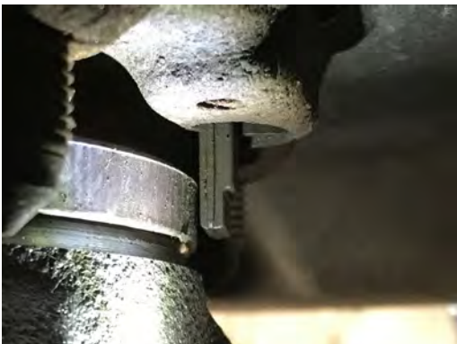
Fig. 2 Brake disc and sensor correctly installed

With the old brake disc removed from the vehicle, the wheel speed sensor should be inspected for excess corrosion surrounding the mounting area. It is important to note that any excess metal corrosion can alter the position of the sensor – affecting its functionality. This can lead to direct contact with the reluctor, causing damage to the new brake disc assembly (Fig.1). Subsequently, an increased air gap between the sensor and the reluctor can also occur, resulting in an anti-lock brake system fault – logged as a sensor implausibility signal fault code in the brake control unit.