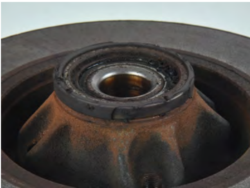
Fig. 1 Damaged reluctor due to contact with the sensor

Many Peugeot, Citroën and DS models are equipped with rear brake discs that have an integrated wheel bearing. As a result, this type of assembly allows for significant weight saving, since the brake disc also becomes the wheel hub. This pre-assembled part also makes replacement quicker and easier for the workshop, whilst eliminating the risk of mounting a bearing with incorrect clearance or seal positioning.