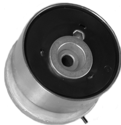
Fig. 2 New design

Once the hex key is removed, the tension is automatically set.