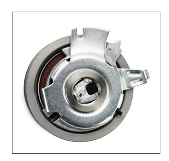
Fig. 2: Version 2