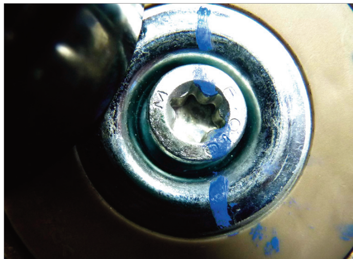
Dayco Tensioner APV1156 with a Torx head bolt for Suzuki and some Opel and FIAT models.

Use the table above to properly identify the correct replacement