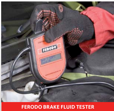
FERODO BRAKE FLUID TESTER

Conductivity or "pen-type" testers do not boil the fluid. They estimate the water content electronically. In theory, conductivity (and/or capacitance) increases with moisture content, but these testers can potentially fail new fluid and pass contaminated fluid. This is because the conductivity of brake fluid varies hugely from manufacturer to manufacturer, from batch to batch, and from grade to grade. For your safety and that of your customers, make sure to use an adequate tester.