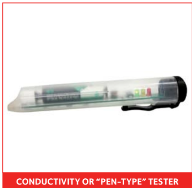
CONDUCTIVITY OR "PEN-TYPE" TESTER

Although many vehicle and brake manufacturers give minimum recommendations, the right time to change the brake fluid should not be based on the vehicle's mileage or age. The only real way to know is to test the brake fluid. And the only approved way to test it is by boiling it.