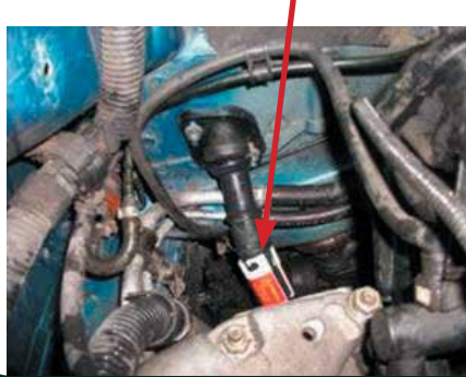
Release auto adjust mechanism by removing retention cap - fit cable into 2nd body clip