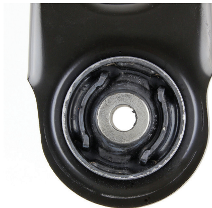
New improved design