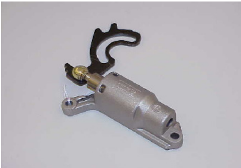
FIG #2 - NEW SYSTEM 153 Tooth Belt [T317]

Please note if you are removing a system that has been updated, there could be a difference in the spacer that is included with the pulley. The one that is included in the TCK317 kit has a 6mm thick spacer; the other which is only available from the OE is 3mm thick. These are not interchangeable on the drive. Incorrect distance will cause premature belt and drive system failure.