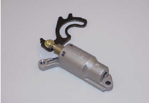
FIG #1 - OLD SYSTEM 152 Tooth Belt [T291]

A 152 tooth belt [T291] CANNOT be combined with the updated components pictured below [Fig #2]. And a 153 tooth belt [T317] cannot be placed on the older version of the drive set up without risking engine damage [Fig #1].