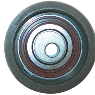
T42086 - Rear