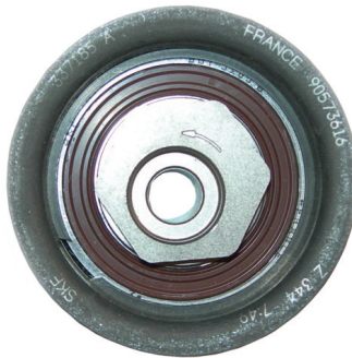
T42086 - Front