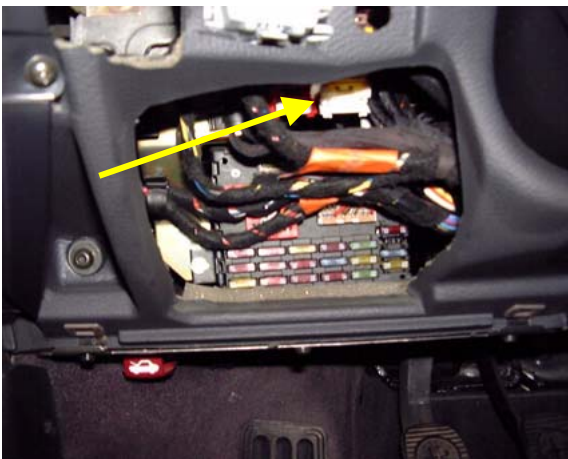
Picture 1: ABS-fuse: below the instrument panel, left next to the steering column (LHD)

Notice: Installation location and specific details of the fuses can vary depending on model and country version. With repeated failure of the fuses, further fault diagnosis has to be carried out using the test instructions of the manufacturer and use of the wiring diagram. Furthermore any fault codes should be read and cleared out with a suitable diagnosis tool.