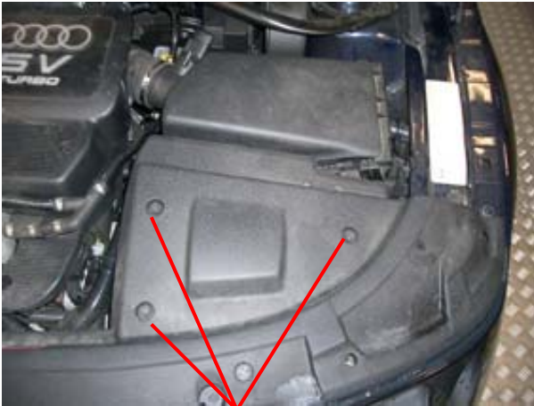
3 screws Fig. 3