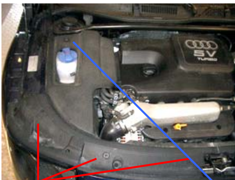
Clip (a) Screw (b) Fig. 1