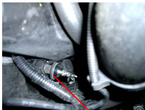
Indicator socket Fig. 2