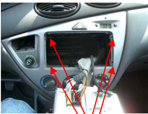
Picture 1, 4 screws