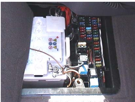
Picture 1 Fuse box