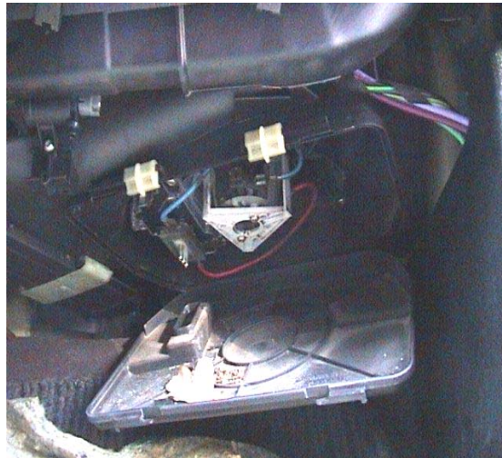
Passenger compartment blower