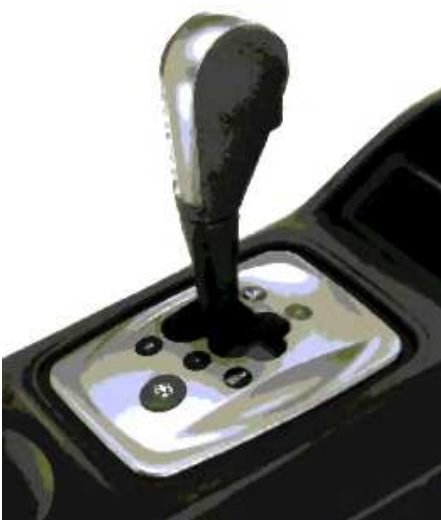
Gear lever MTA gearbox

With the above-mentioned vehicles, communication problems can occur between the exhaust emissions unit and the control unit during the OBD exhaust emissions test. In these cases the fuse (F6) of the MTA gearbox should be removed before the exhaust emissions test is started. Then the test procedure can be followed up to the step "start engine". The fuse must be replaced before the engine is started. After a brief wait of 20 seconds, the OBD exhaust emissions test can be continued.