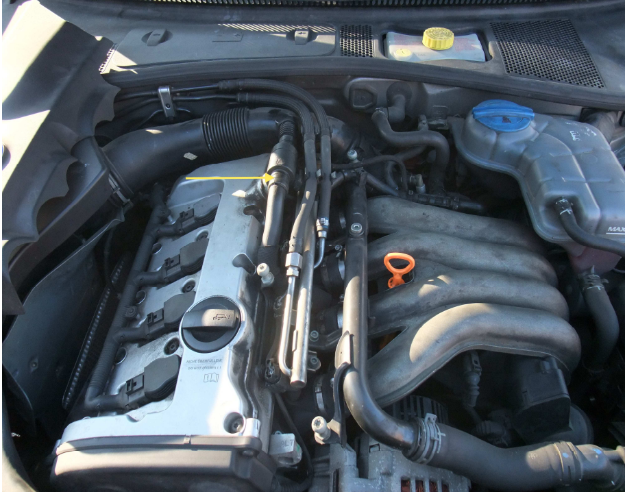
Figure 3: View / location in the engine compartment with cover