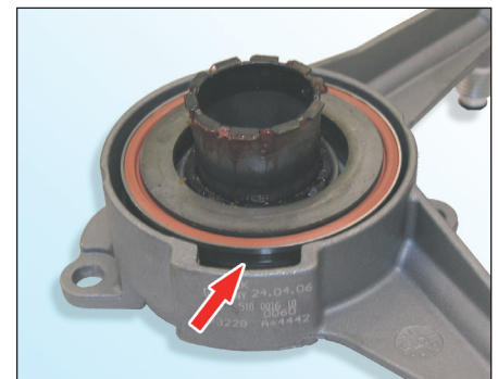
Fig. 3: Correct

In order to avoid damage to the clutch and the transmission as well as additional unnecessary repairs, the correct positioning of the release bearing in the concentric slave cylinder must be verified (see fig. 3 ).