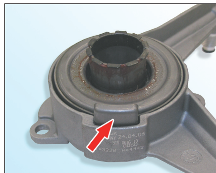
Fig. 2: Wrong

Note the specifications of the vehicle manufacturer!