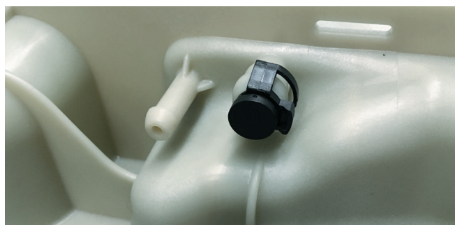
Figure 3: For Euro 4 and 5, the connection must be sealed using a dummy plug.