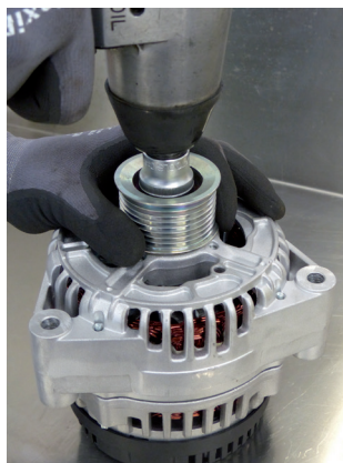
Figure 2: Impact drivers are only used to loosen the pulley, NEVER to tighten it!