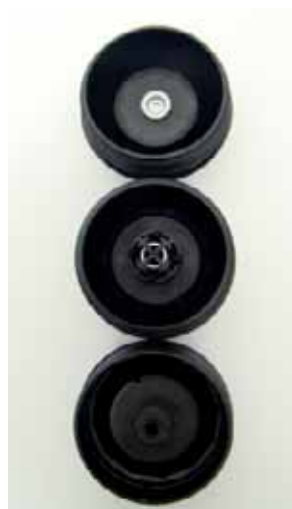
Figure 2: Oil filter, inner view: three different threaded covers