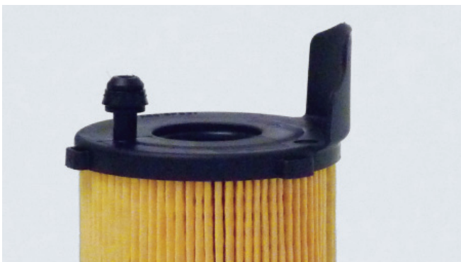
Figure 3: Replica with blade: while it may not damage MAHLE's patent, it can potentially damage the by-pass valve on the engine.

With any luck, the pin won't seal the drainage bore properly, which will result in noticeable oil pressure problems and bring the assembly error to the attention of the repair shop before any engine damage occurs.