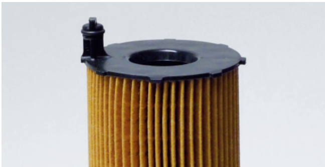
Figure 1: Well thought-out to the last detail: the patented pin for the MAHLE oil filter insert with O-ring seal.

THE MAHLE PIN: MULTITASKING IN THE OIL FILTER A black plastic mandrel with an O-ring seal is mounted at the end plate of the filter element—known throughout the industry as the MAHLE pin. In the assembled state, the pin fits precisely into the bore in the filter housing and seals it off.