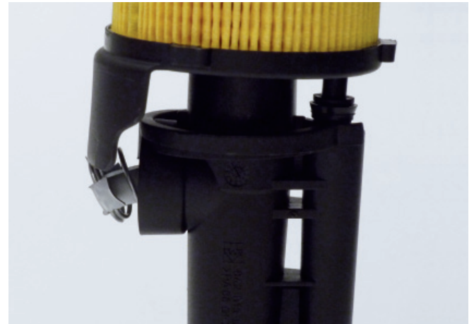
Figure 4: Detailed view of the damaged by-pass valve.

Another problem: the sharp plastic blade can come dangerously close to the by-pass valve in the housing, damage it, and put it out of action. This means: the by-pass valve, which should only be opened for short periods in certain situations, is now permanently open—and lets the unfiltered oil circulate (unnoticed!) continuously through the engine. The inevitable consequence is serious engine damage!