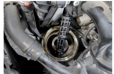
Figure 3: Without the oil filter back pressure, the standpipe can pop out of the flange.