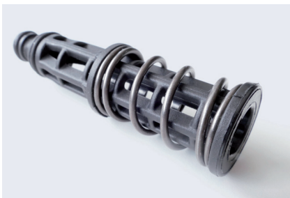
Figure 1: Removed standpipe

If the standpipe can be found, it can be cleaned and reinserted into the flange. It's important to ensure that the rubber gaskets are sealed and in perfect condition. In case of doubt or if the standpipe is lost, a replacement can be obtained from the original spare parts market. The original part number is: 06J 115 679 E.