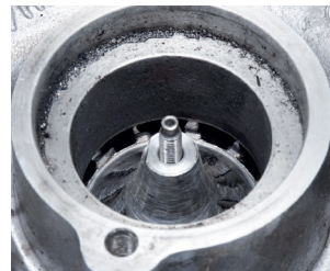
Figure 1: Impeller completely destroyed by foreign objects

charge air cooler, where they can cause score marks on the cylinder running surfaces or burned-out exhaust valves, among other things. Owing to the high exhaust gas velocity, these particles themselves can pass through the cylinders and damage the turbine wheel of the new turbocharger.