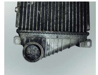
Figure 2: Chips from the destroyed impeller in the charge air cooler