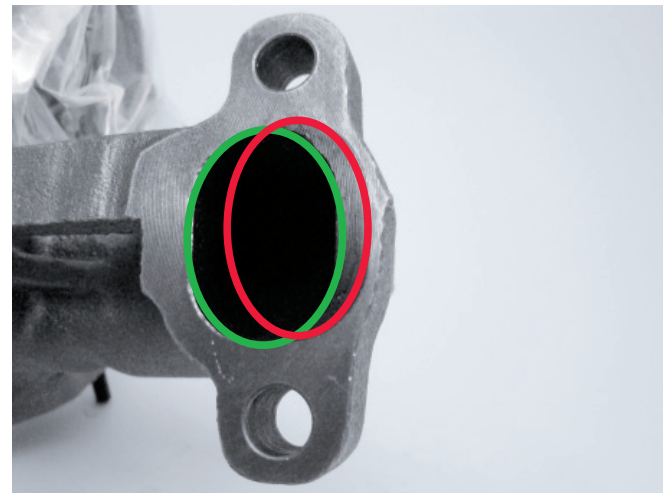
Figure 2: Example for 030TC15116000: Red oval: incorrect position; green oval: correct position