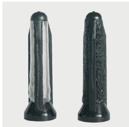
Prefilter of the E1F: new on the left, blocked on the right