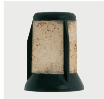
Prefilter of the E3T – blocked by rust

Most modern fuel pumps are flushed through with fuel, which lubricates and cools them. If this does not happen to a sufficient extent, e.g. through soiling, there is a risk of "dry running". Fuel pumps in the E1F, E2T and E3T series are equipped with a built-in prefilter on the intake side. This small prefilter provides protection against contamination. It can become blocked due to dirt in the intake air.