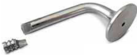
Fig. 1: forced breakage at groove

Frequently, after a repair to a cylinder head, valve breakage occurs in the area of the valve cotters (Fig. 1) after a short running time. Valves with a stem diameter of 7 mm or less are especially prone to this problem.