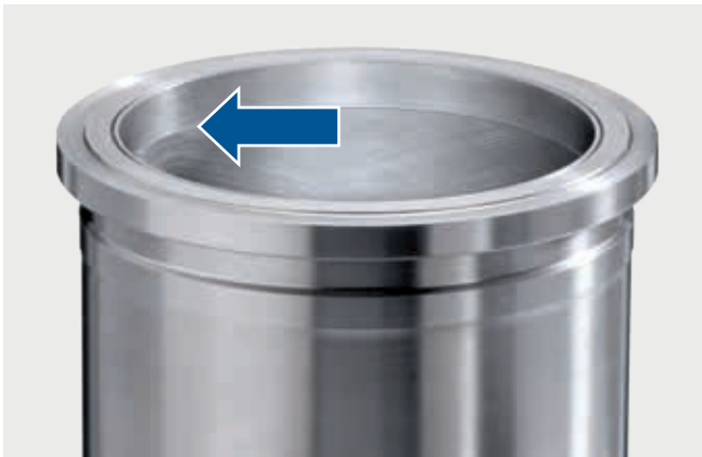
Fig. 1: Cylinder liner