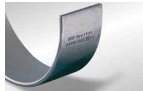
Fig. 2: KS Sputter bearing shell

For a better differentiation, KS Sputter bearing shells are marked with the word “Sputter” on the back of the bearing (Fig.2). As a result, the bearings are clearly distinguishable from bearing shells of the conventional type.