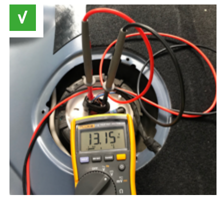
Fig. 2: Electrical plug contact on the cover of the fuel delivery module