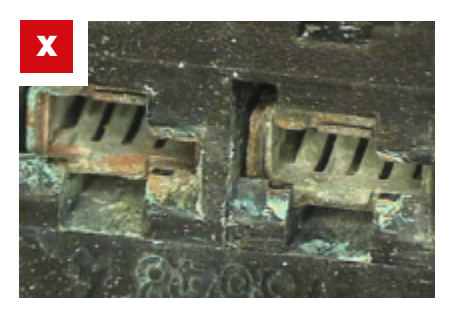
Fig. 5: Corrosion on the contacts