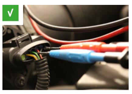
Fig. 3: Measuring tips on the rear of the plug