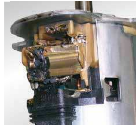
Damage symptoms: melting traces on the electric motor or on the electrical contacts