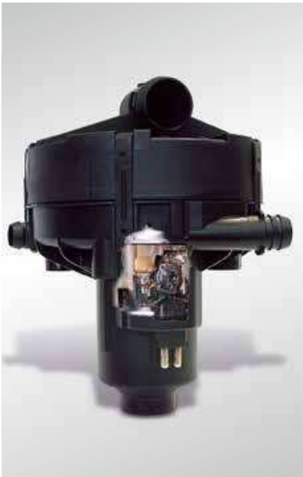
View into the secondary air pump (cut) with melting traces