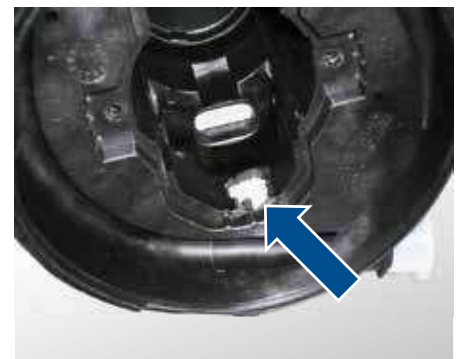
Damage: melting traces on the housing (top view into the housing)