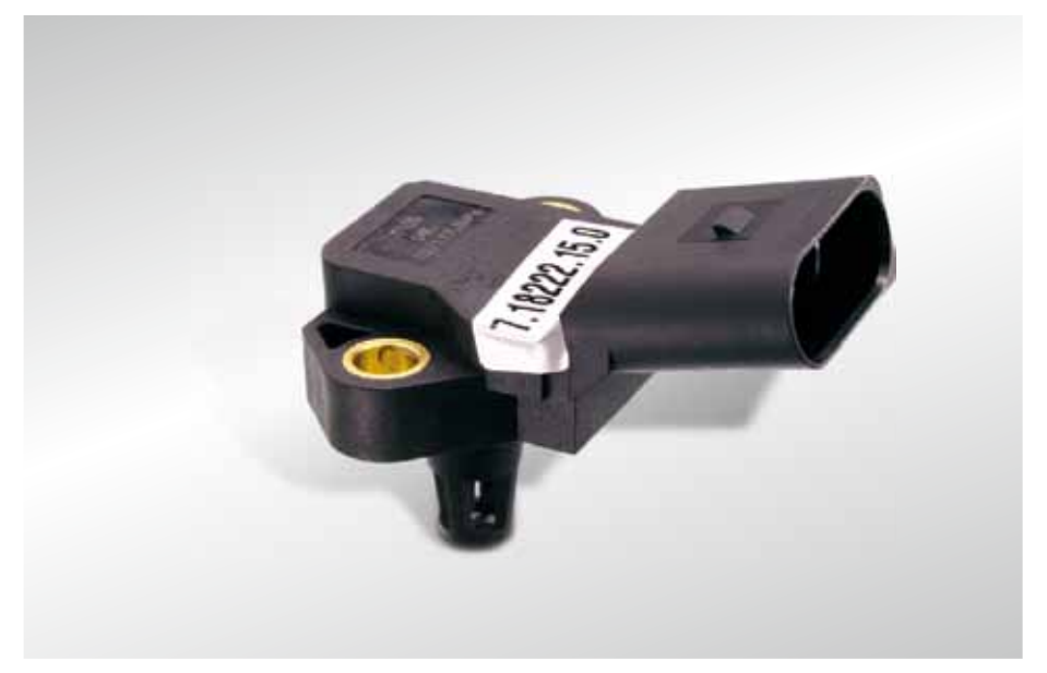
Fig. 1 Intake manifold pressure sensor/MAP sensor (MAP = Manifold Air Pressure)