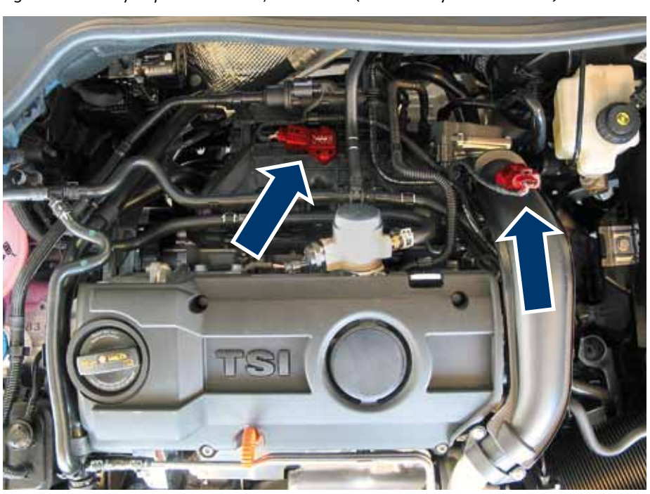
Fig. 2 Intake manifold pressure sensors (red) in a VW Golf IV

The right of changes and deviating pictures is reserved. Assignment and usage, refer to the each case current catalogues, TecDoc CD respectively systems based on TecDoc.