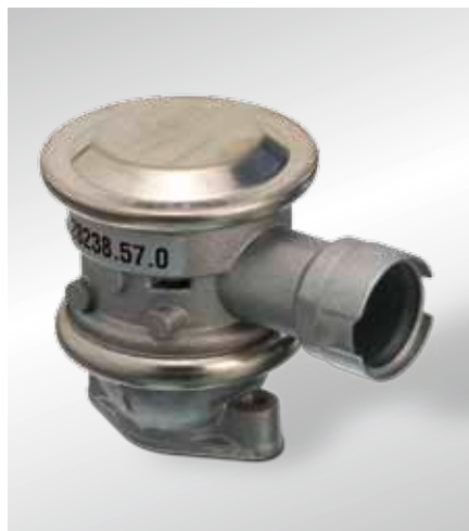
Pressure-controlled valve with shut-off and non-return function (since approx. 1998)