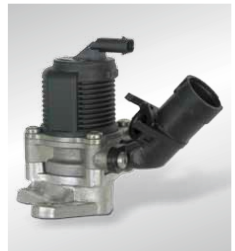
Solenoid Secondary-air valve (since approx. 2007)