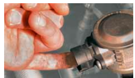
Finger check at secondary-air valve in BMW 520i (highlighted) If deposits are found on this end, the non-return valve is leaking and must be replaced.