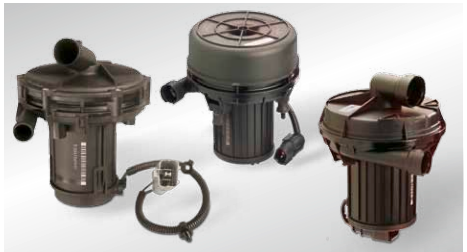
Various 1st and 2nd generation secondary-air pumps

Solenoid secondary-air valves may be equipped with an integrated pressure sensor for on-board diagnosis (OBD) monitoring.