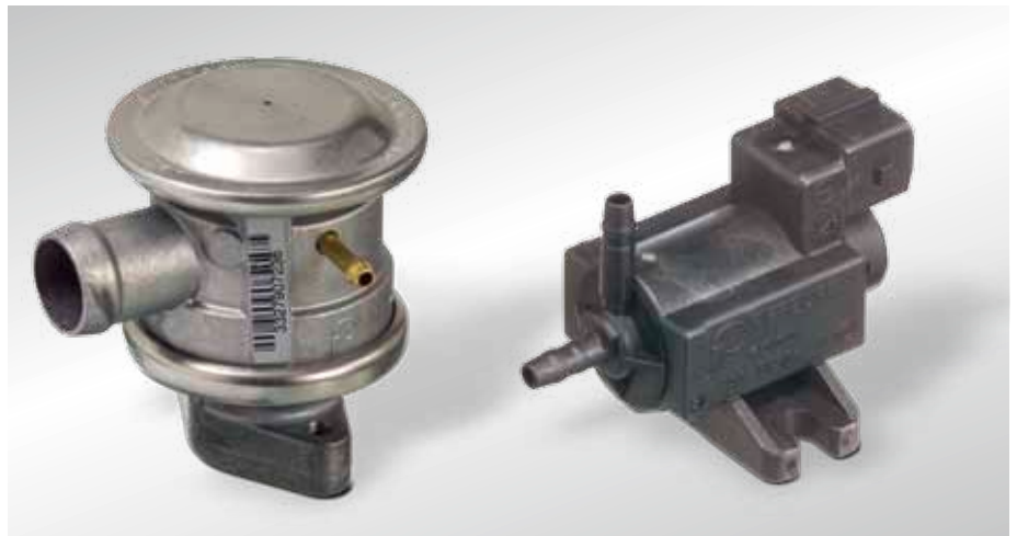
Vacuum-controlled valve with shut-off and non-return function (since approx. 1995) and solenoid switching valve