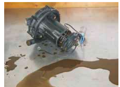
Liquid exhaust gas condensate from a secondary-air pump