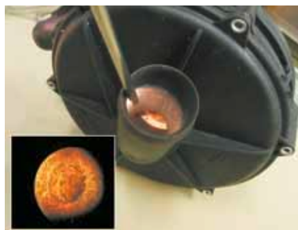
View of the corroded inlet of a secondary-air pump