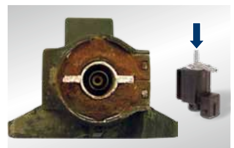
Corroded solenoid switching valve (open)