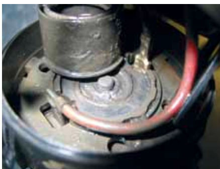
Corrosive exhaust gas condensate in the drive motor of a secondary-air pump

If the secondary-air is drawn in directly from the engine compartment rather than from the intake system, the separate air filter fitted upstream of the secondary-air pump may be clogged.