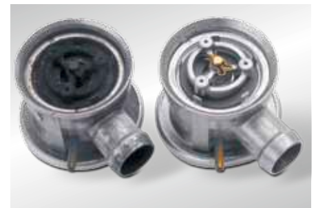
Open secondary-air valve left: damage caused by exhaust gas condensate right: as-new condition