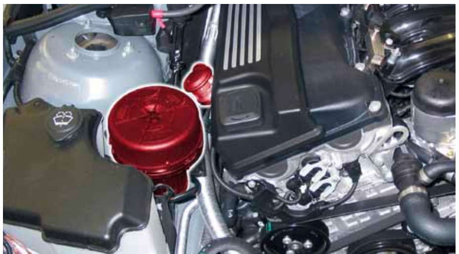
Secondary-air valve and secondary-air pump in BMW E46 (highlighted)

The right of changes and deviating pictures is reserved. Assignment and usage, refer to the each case current catalogues, TecDoc CD respectively systems based on TecDoc.