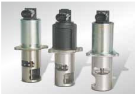
Product view (extract)