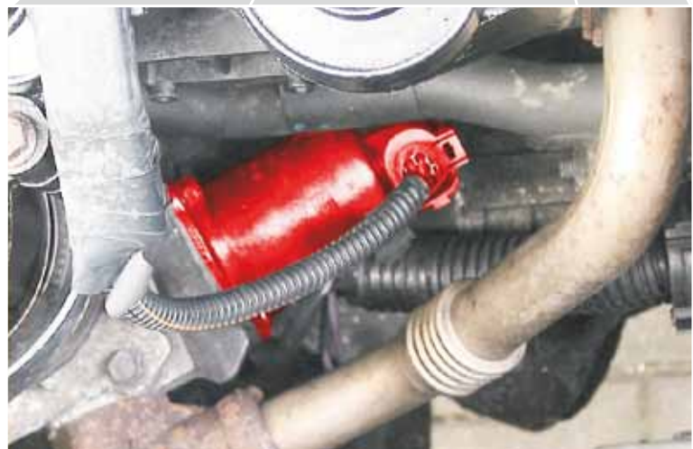
EGR valve in the Renault Master JD1M (highlighted)