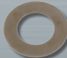
Diamond-coated crankshaft washer

In order to avoid costly consequential damage, the SWAG vibration damper repair kits for Volvo 850, S70, S80, V70 I, V70 II, VW Crafter/T4 and Audi A6 include the diamond-coated crankshaft washer.