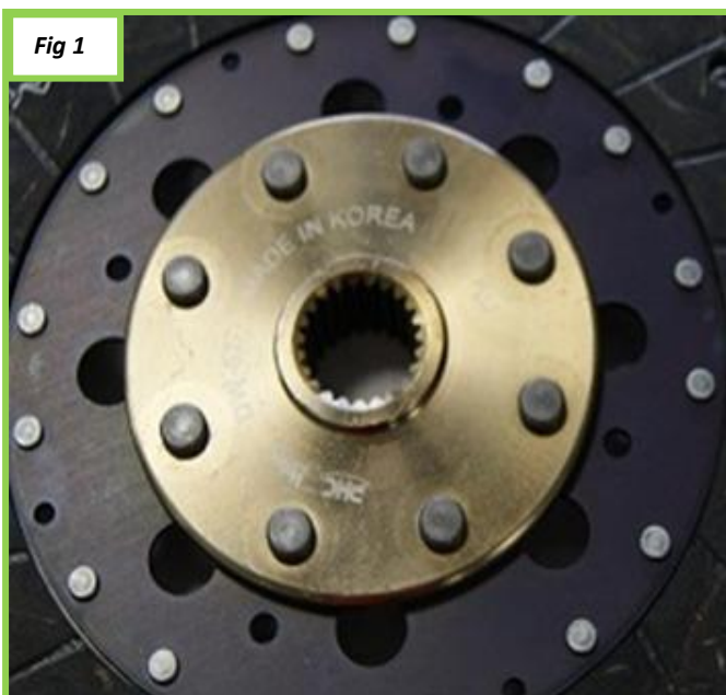
Friction plate side to be mounted gearbox side

Please be aware when fitting the friction plate in 826836 the side stating "made in Korea" (Fig 1) fits into the clutch cover and the side with the raised splined hub (Fig 2) fits into the recess of the flywheel.