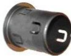
Ford service repair tube

To help avoid this premature failure, Ford offer an additional service repair guide tube (a steel sleeve that slides over the original aluminium tube & is then locked by pressing in the tabs).