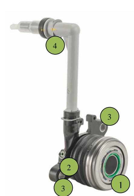
Old design of 804526 / 804570