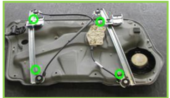
Fig 3. Valeo design with screws

Before installing the bottom screw of the window lift: