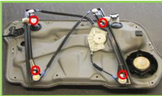
Fig 1. Original OE design with rivets

Please note in order to remove the pre-existing window regulators from the vehicle the rivets must be drilled as per Fig 2. Valeo window regulators 850524 and 850525 have screws and threaded connections that replace the riveted design.