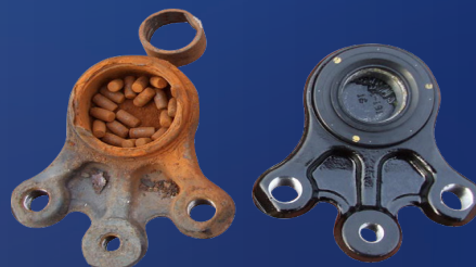
Figure 2: Ball Joint with & without Inner Race