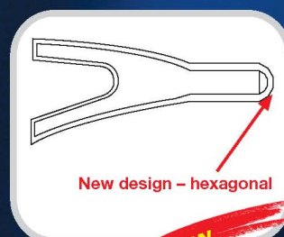
New design - hexagonal